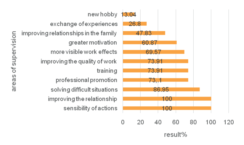
Chart 2. Effects of supervision process (N = 23)

Pedagogues of day-care rooms were asked about their achieved results in the process of supervision both in professional and personal spheres. The results of supervisions that were indicated by participants of the process are presented in chart 2. Respondents were able to indicate more than one answer.